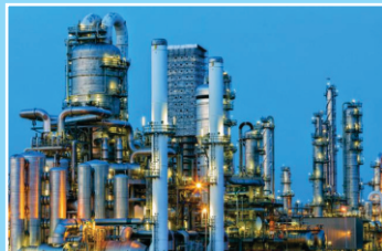
Chemicals & Fertilizers