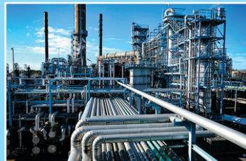
Refineries (Oil & Gas)